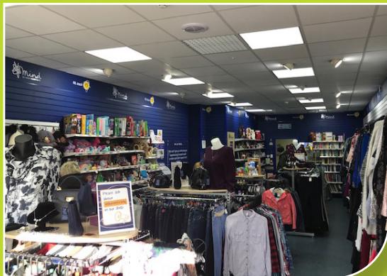
Indicative example of interior

Other retailers within the block include Coral, Barnardos, Iceland and Cohens. Mind have also recently committed to the scheme.